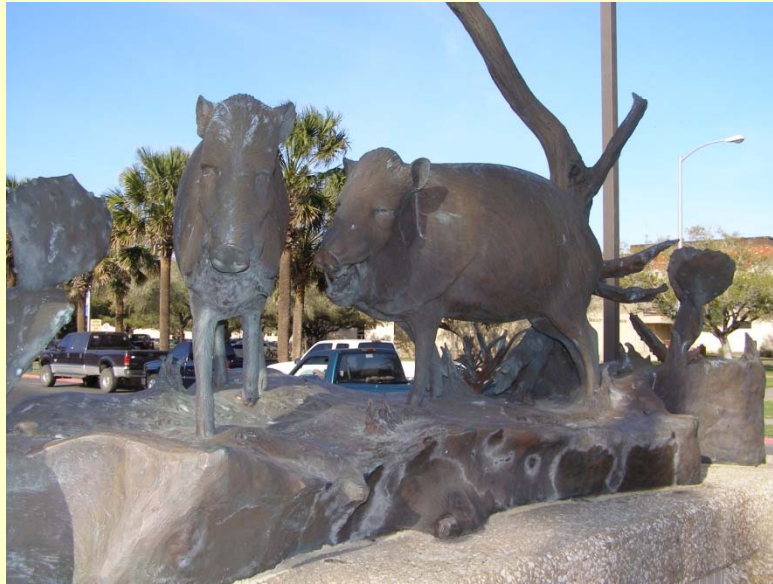
Bronze sculpture at the entrance to Texas A&M University-Kingsville.